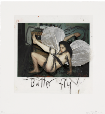
Kiki Smith, Butterfly, Bat, Turtle , 2000 [here: Butterfly]