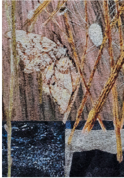
Kiki Smith, Spinners , 2014 (Detail)