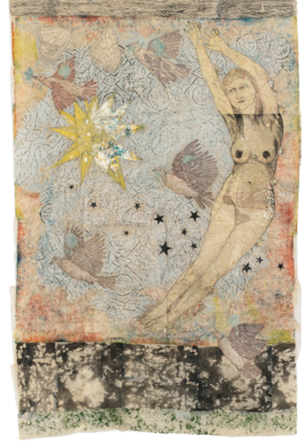
Kiki Smith, Sky , 2011