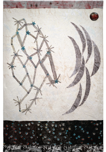
Kiki Smith, Visitor , 2015