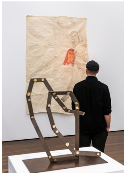
Exhibition view "Kiki Smith"