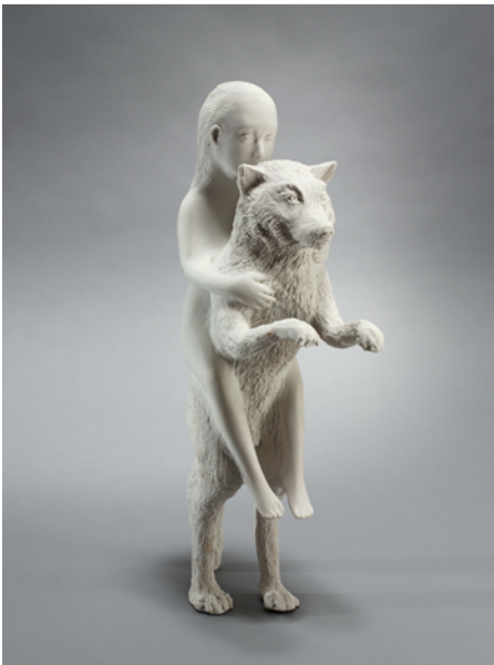
Kiki Smith Woman with Wolf , 2003