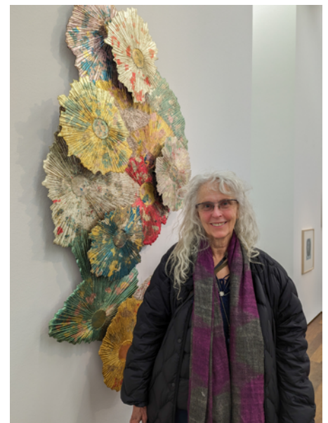
Kiki Smith in front of her sculpture Harmonies III, 2011