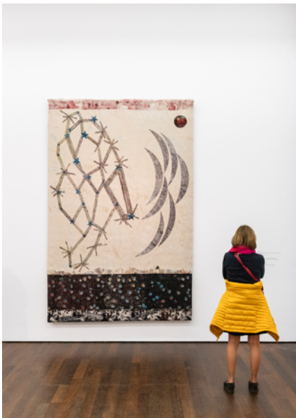
Exhibition view "Kiki Smith"