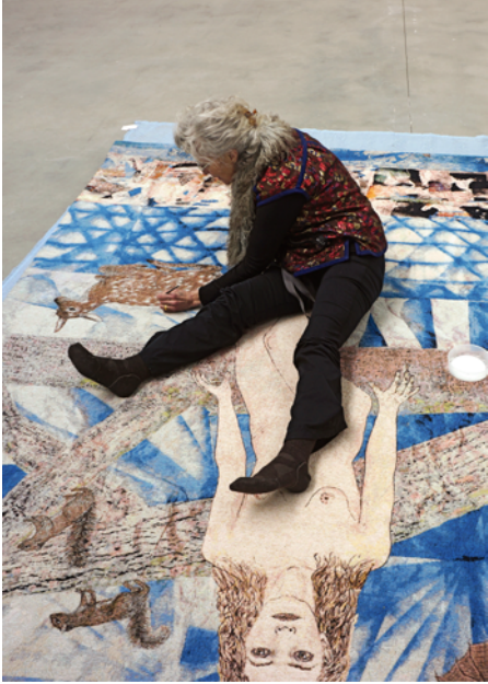
Kiki Smith at the studio

all works © Kiki Smith, courtesy Pace Gallery