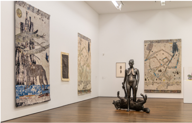
Exhibition view "Kiki Smith"