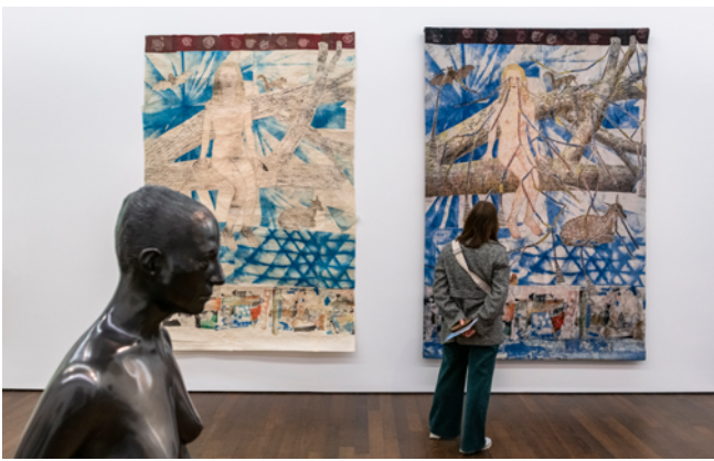
Exhibition view "Kiki Smith"