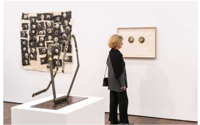
Exhibition view "Kiki Smith"