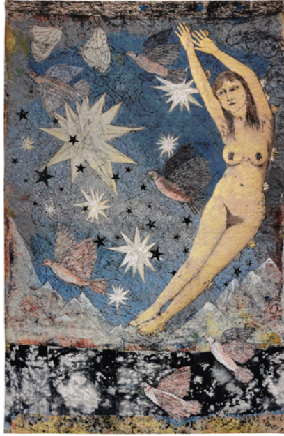
Kiki Smith, Sky , 2012