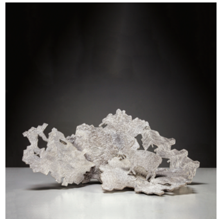
Kiki Smith, Hoarfrost , 2014