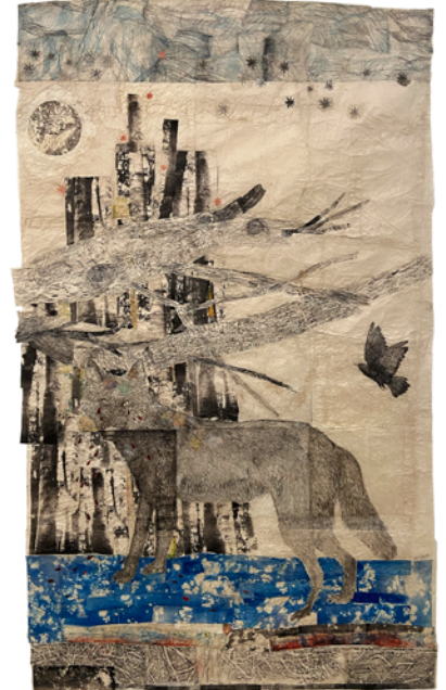
Kiki Smith, Cathedral layout , 2012