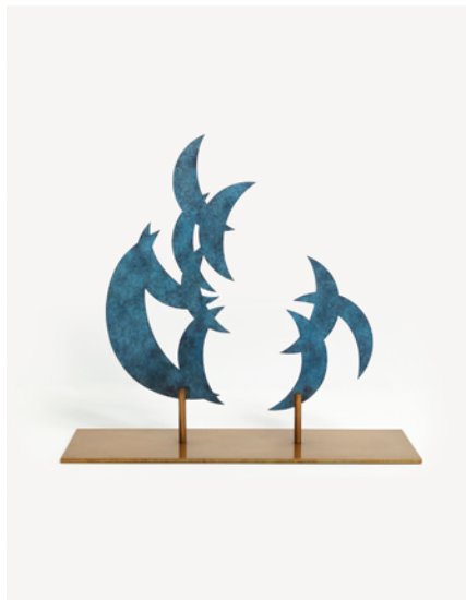
Kiki Smith, Shadow 3 , 2019