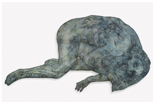
Kiki Smith, Fallen , 2018